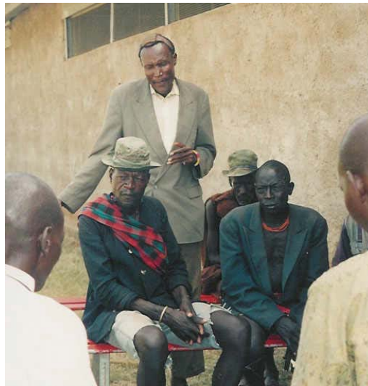
Epuron, an elder from Lorengippi, addresses the administrators during the creation of epiding action plans.

In the past, extensive action plans have been generated that are only partially implemented. These plans often list extensive activities to be carried out by actors that are not aware of the commitment being made for them. For this reason, the action plan development was focused on three main actions, prioritized by all stakeholders in the groups. Additionally, a lead agency was selected, not necessarily to implement the activity themselves, but to ensure that action will be taken and to follow up with other actors involved.